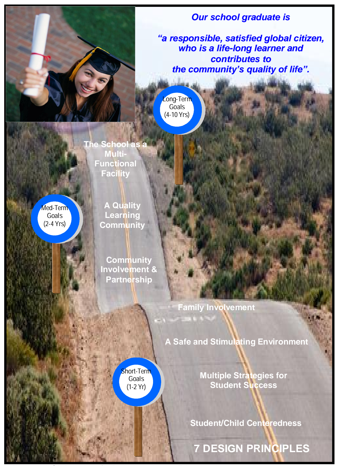
Figure 4. NOP Road Map for Re-Invigorating the Educational Journey